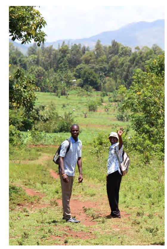
"Kwaheri" and all the best for the new year 2017! Many greetings from Maseno